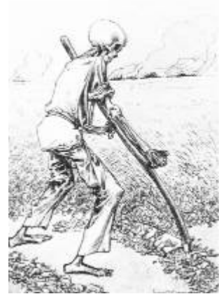
The Grim Reaper by Louis Raemaekers

The influenza pandemic of 1918-1919 killed more people than the Great War, known today as World War I (WWI), at somewhere between 20 and 40 million people. It has been cited as the most devastating epidemic in recorded world history. More people died of influenza in a single year than in four-years of the Black Death Bubonic Plague from 1347 to 1351. Known as "Spanish Flu" or "La Grippe" the influenza of 1918-1919 was a global disaster.