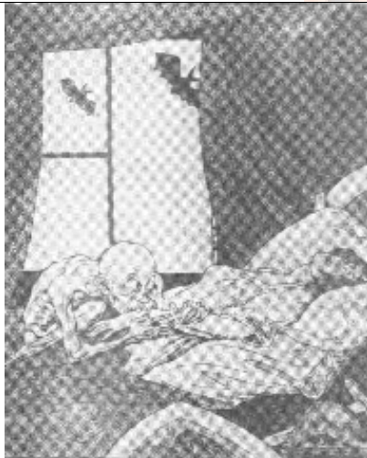
Clemenceau the Vampire